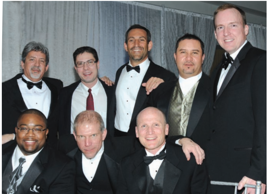
Hurley Trauma and Emergency Physicians