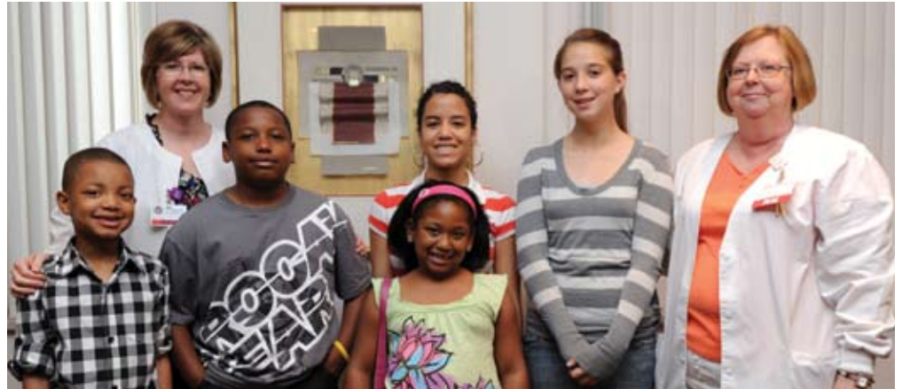
"Stars" of the hurleyasthmakids.com website

At Hurley Medical Center, we take asthma very seriously. In fact, we're a leader in the state of Michigan for asthma care, with the only home-based Asthma Disease Management program in the region. Our Asthma Disease Managers go to health fairs, schools, congregations, doctors' offices, and community centers to teach people how to control, and prevent asthma. Now, we have a new tool for patients and families everywhere: Hurleyasthmakids.com.